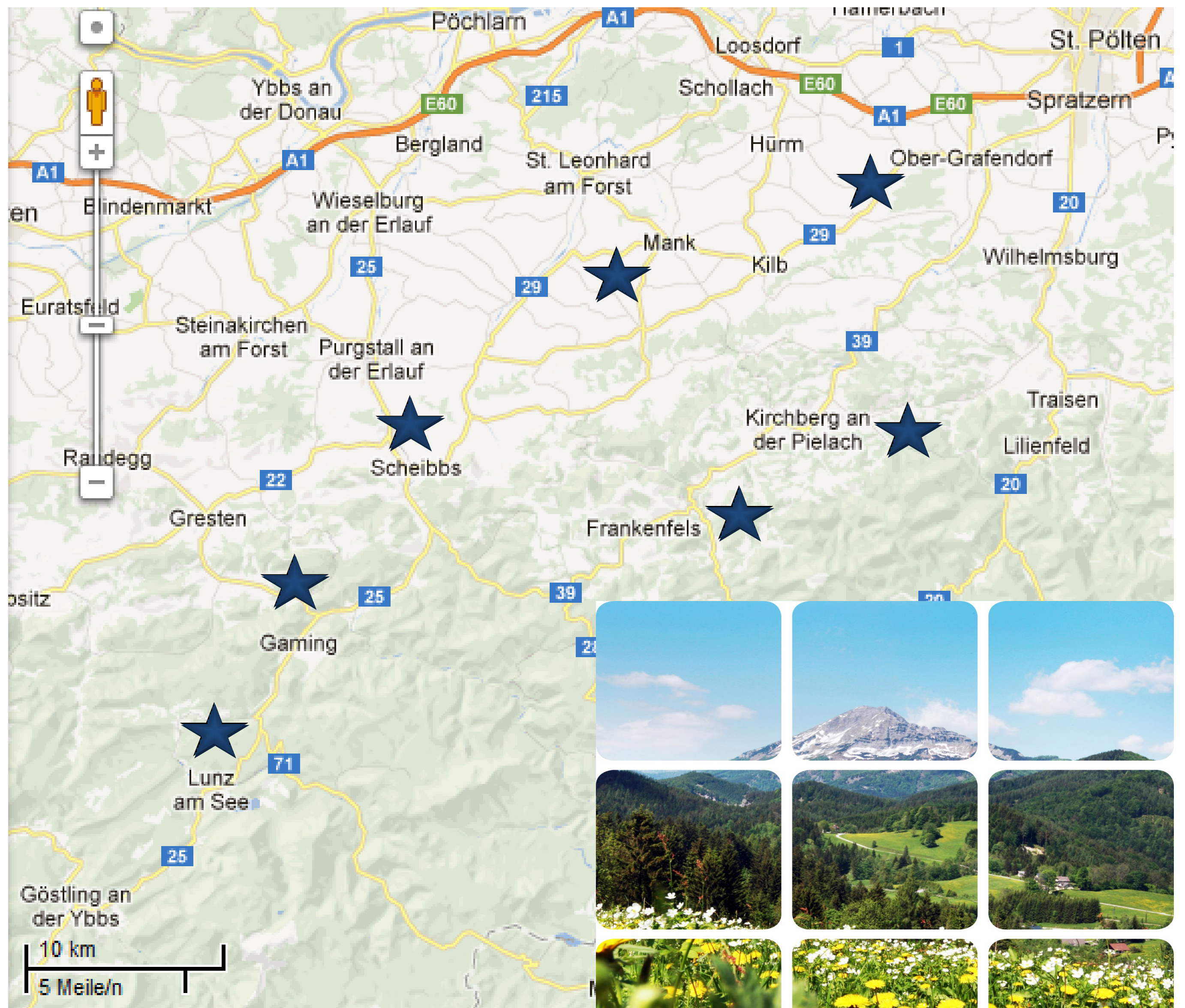
The Ötscher mountain, located in the south of Mostviertel, is the region's highest peak, at almost 2,000 m.

www.klimabuendnis.at/ wandelbares.mostviertel